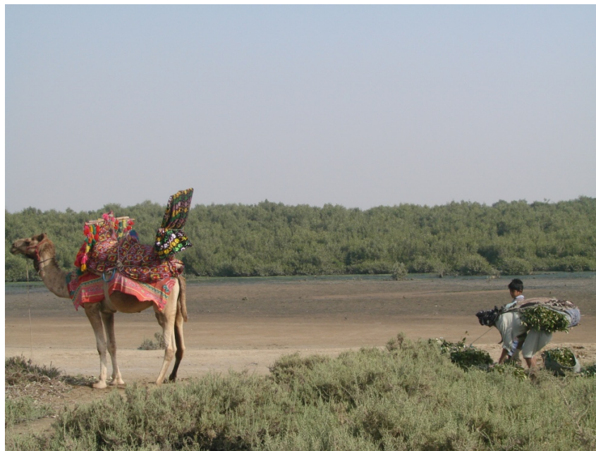
Fig. 1. Mangroves Forest at Sandspit Backwaters Area, Karachi.