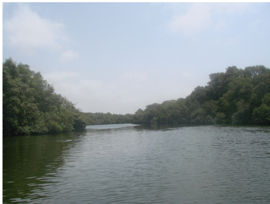
Fig. 2. A view of Mangroves Forest at Keti Bunder.

Among the birds, a wide variety of birds has been recorded, comprising of waterbirds, birds of prey, passerines and others. As many as 78 species have been recorded. The key/widespread species include: Kentish Plover ( Charadrius alexandrinus ), Terek Sandpiper ( Tringa terek ), Common Sandpiper ( Tringa hypoleucos ), Grey Heron ( Ardea cinerea ), Bartailed Godwit ( Limosa lapponica ), Little Stint ( Calidris minutus ), Dunlin